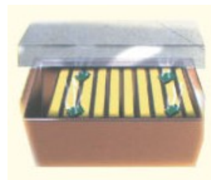
Fig. 4 Close the hive and let the product act for 7 days. Repeat the explained treatment for 4 times with the other strips and remove the possible pieces of strip at the end of the treatment.