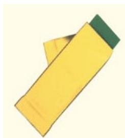
Fig. 1 Open the proper bag that contains the two strips.

It is not recommended to use the product in multiple storey hives as unsatisfactory efficacy might be expected.