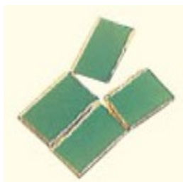
Fig. 2 Take one of the two strips and break it into 3-4 parts