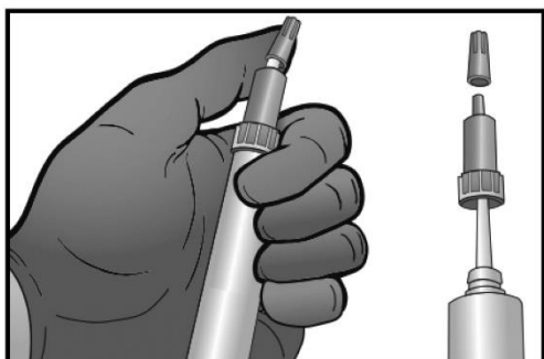
Step 1: Removal of the breakable cap