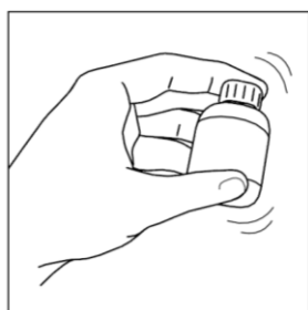
Figure 1: Administration of the product